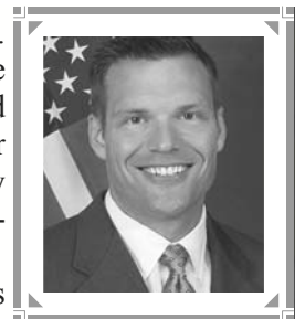
Prof. Kris W. Kobach

Kris W. Kobach is Professor of Law at the University of Missouri-Kansas City School of Law and is representing the U.S. citizen plaintiffs who have filed suit in two states (Kansas and California) to enjoin a state statute from providing in-state tuition rates to illegal aliens asserting violations of federal law and the Equal Protection Clause of the U.S. Constitution by discriminating against them as out-of-state-tuition students in favor of illegal aliens. He served as counsel and chief adviser on immigration law and border security to U.S. Attorney General John Ashcroft